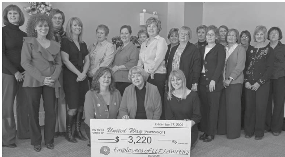
Employees of Lockington Lawless Fitzpatrick, proudly display their contribution to United Way as one of our newest workplace campaigns.