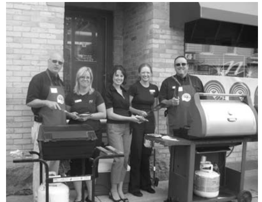
Nexicom staff take it to the streets of Millbrook with a BBQ for the United Way.