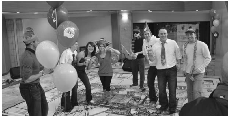
Trent Students 'Groovin for United Way' at Peterborough Square