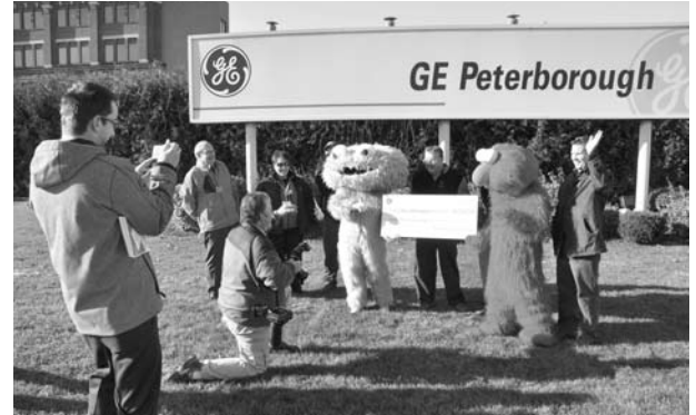
Members of the GE Peterborough United Way campaign committee have fun with the media as they announce the 68th consecutive year that their employee campaign has raised the largest collective donation to United Way.